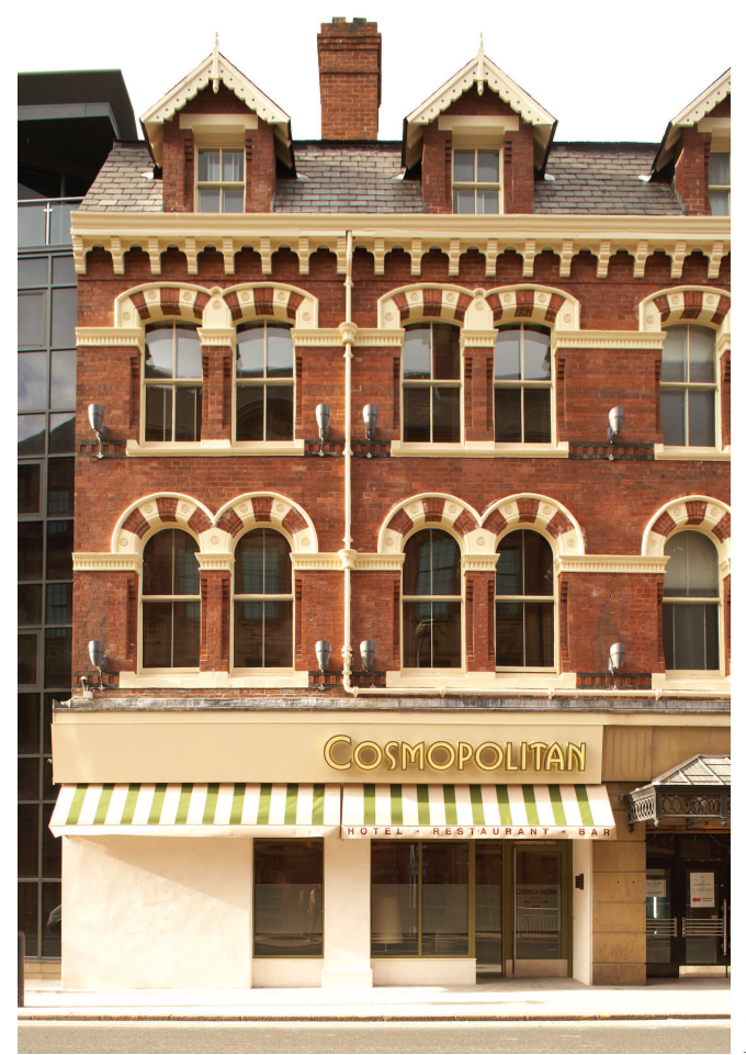
The remodelled Cosmopolitan Hotel, Restaurant and Bar in Leeds.

We have begun the re-launch of the Cosmopolitan Hotel, Restaurant and Bar in Leeds (formerly the Golden Lion Hotel). The external elevations have been remodelled and all the public areas including a new restaurant, bar and kitchen are in the process of being designed and rebuilt to reflect a boutique style trendy hotel.